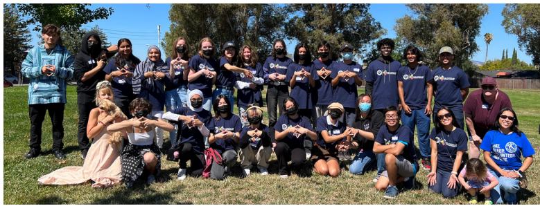
CTTP Volunteer Tutors at Celebration Party - Many are proud members of Division 8 Key Club